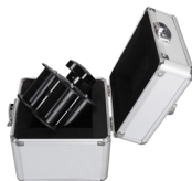
Front extraction tool