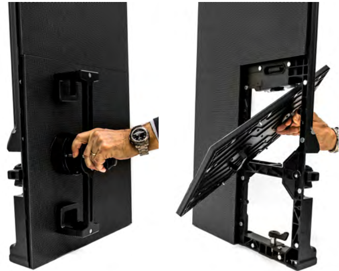
Easy front & Back Maintenance